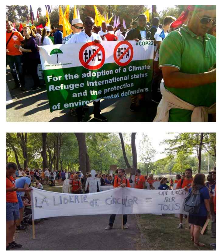
"Freedom of movement is a right for all"

line with the principle of climate justice and must be based on both the loss/damage and adaptation criteria defined by the United Nations Framework Convention on Climate Change (UNFCCC), as well as the Global Migration Pact adopted by 191 States within the United Nations in September 2018.